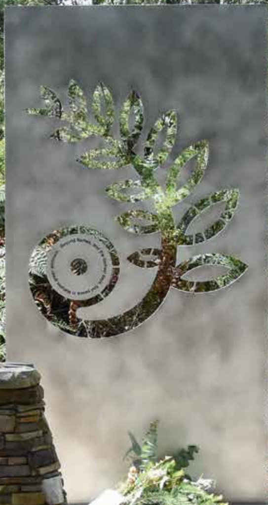
Memorials at Narbathong (above) and at Marysville

Bushfire memorials provide reflective, respectful public spaces that acknowledge the loss experienced by communities affected by the 2009 bushfires. Murrindindi Shire Council formed the Bushfire Commemorations Working Group in 2009 to provide community input on the design of six bushfire memorials across Murrindindi Shire. The project funds were used to complete the construction of the Marysville and Narbethong memorials.