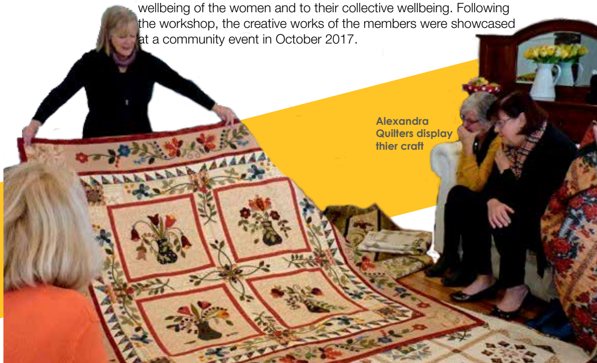
Alexandra Quilters display thier craft

W ithin this project assistance was given to members of the Creative Triangle to attend a workshop to advance their skills. The Creative Triangle was formed in the aftermath of the 2009 bushfires to create a space where women could gather and connect and share their recovery journeys. Creative connections contribute to the confidence and the personal wellbeing of the women and to their collective wellbeing. Following the workshop, the creative works of the members were showcased at a community event in October 2017.